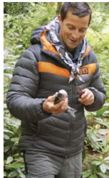
Bear guts fish.

After a hearty fish lunch, the youngsters set about breaking down their bivvies, recycling the greenery to construct a huge