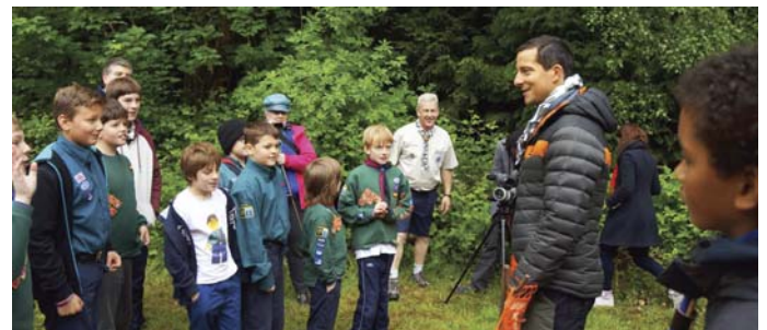
Bear talking to the Cubs.