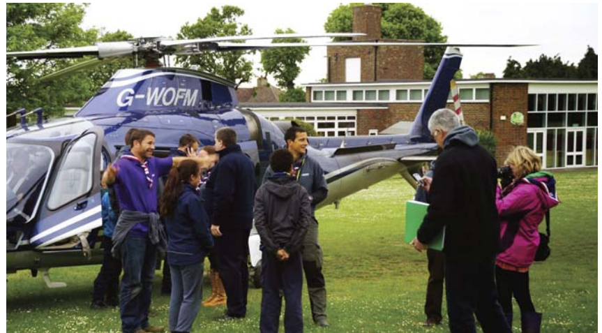
'Bear in the Air' lands on St Johns' Primary School playing field.

A very warm welcome to the July edition of Bourne Again, our redesigned District Newsletter. I sincerely hope you enjoy reading what Croydon Scouting have been doing over recent months and remind you that our next edition of Bourne Again will be published in October.