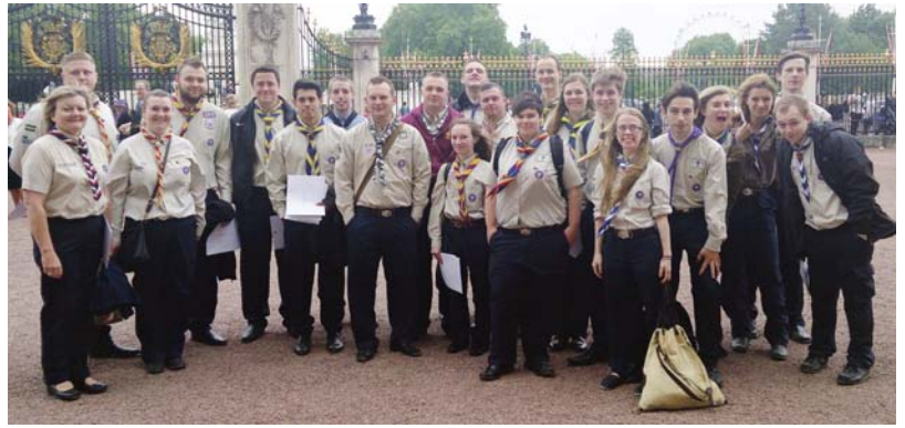
The team of Leaders from Croydon and County by the Palace Gates.