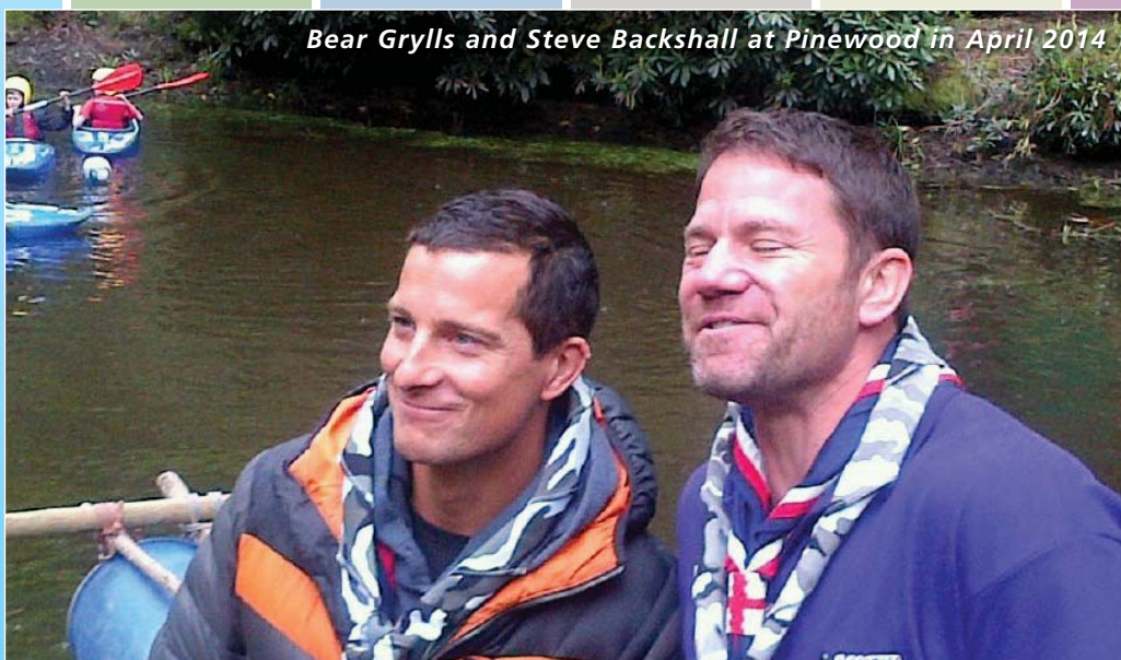
Bear Grylls and Steve Backshall at Pinewood in April 2014