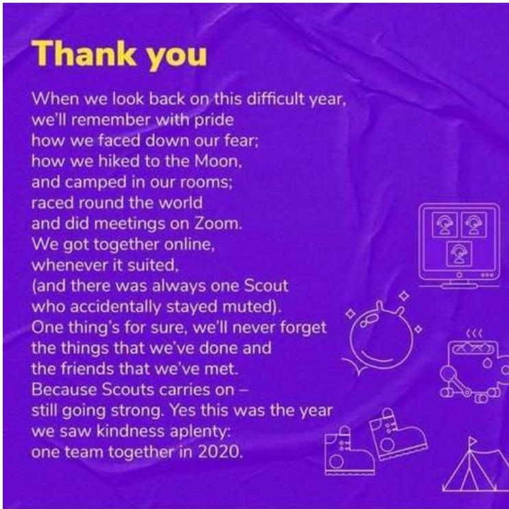
A note from the Scout Association