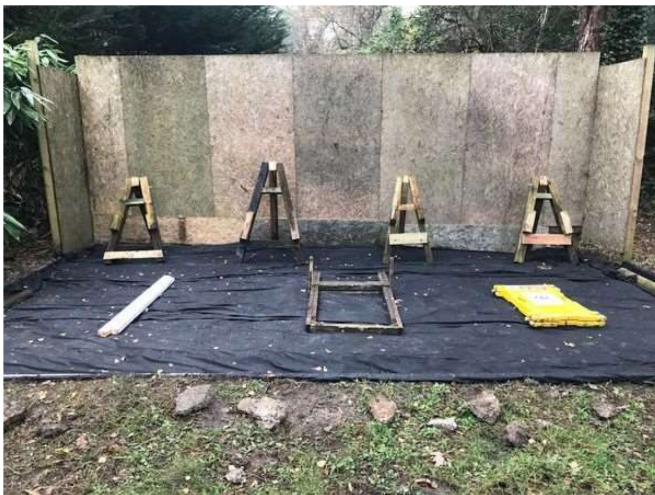
Despite the site being closed for use, we still need to carry out essential maintenance at the Pinewood Scout Centre and above is a picture of the completed tomahawk target throwing area, with stands with membraned frontage.