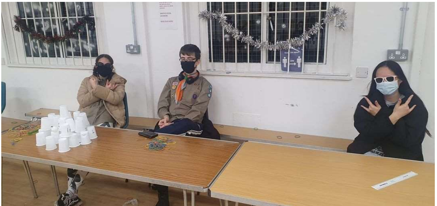
Croham Valley Explorers enjoying an evening of tactical skills – the Ultimate Tower Elasticband Dodge (before lockdown 3)