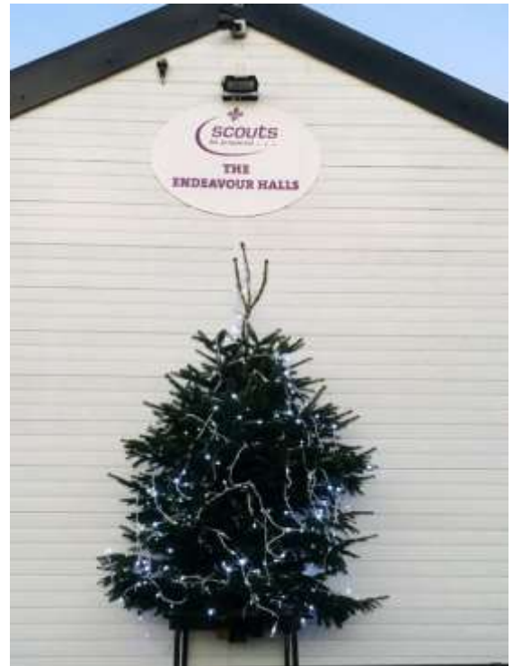
67 th Croydon Group HQ – Christmas Cheer !