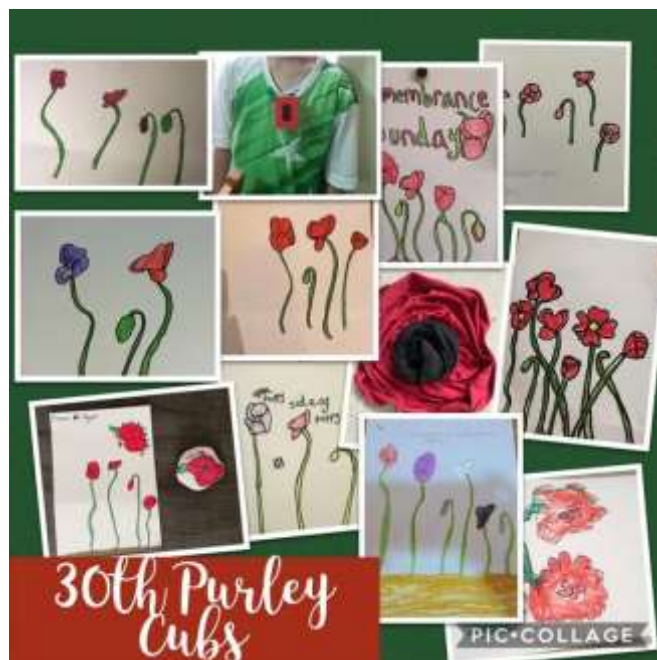
30 th Purley (Masjid) Scout Group Beavers and Cubs remembrance Day Activities